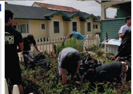
WOW week participants working in the gardens at the Dunes Center.

Education Interns are Needed for the 2011-12 School Year If you know of a youth who is graduating high school and/or is currently attending college and is interested in becoming an intern, please send a letter of interest in the body of an email with an attached resume to: kfox@dunescenter.org