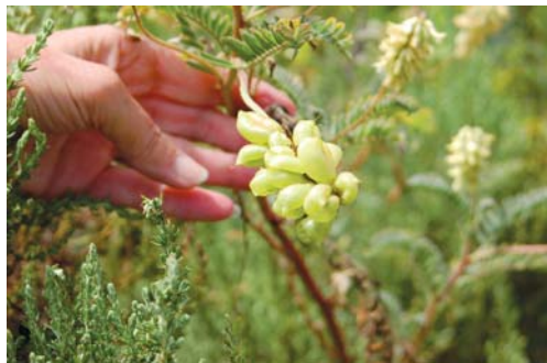
Above: Volunteer holds rattlesnake pods for a photo.