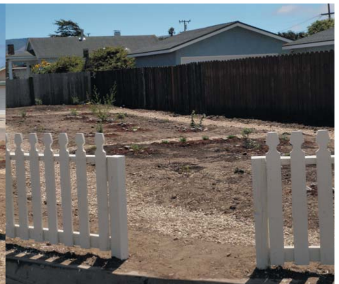
Above: Images from the Guadalupe FITS program native plant garden on 7th & Campodonico Street in Guadalupe, CA