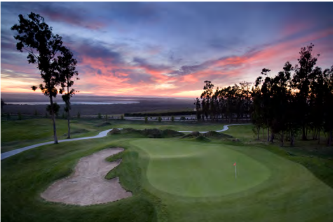
The 10th hole at Monarch Dunes Golf Course in Nipomo, CA.

Price includes, green and cart fee, boxed lunch, range balls, and appetizers at the Butterfly Grill at Monarch Dunes. All contributions are tax deductible. The Dunes Center is a registered 501(c)(3).